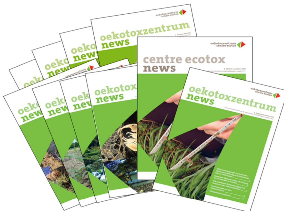
Fig. 3 The Oekotoxzentrum/Centre Ecotox News, the Ecotox Centre's newsletter, appears twice a year

are available free of charge as pdf on the website or can be obtained in printed form by mail. Currently, the Ecotox Centre News are sent to 890 subscribers.